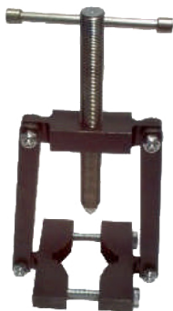
Universal Pump Removal Tool

Quickly removes conventional style pumps without damage