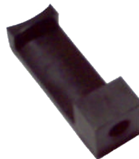
Part No. TOOL.41