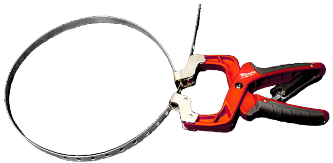
Part No. TOOL.29