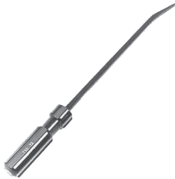
Part No. TOOL.26