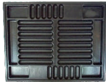
Part No. TOOL.03