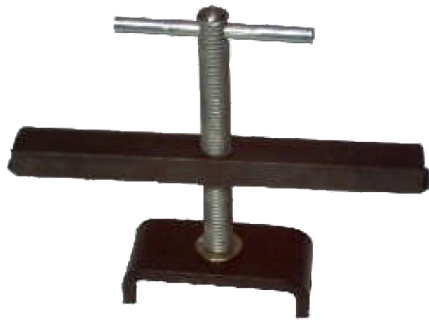
Part No. TH350.TOOL01