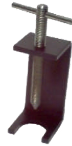
Part No. 4L30E.TOOL02