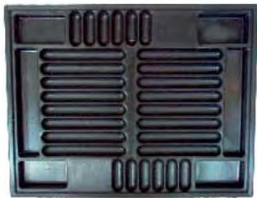
Part No. TOOL.03