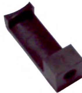
Part No. TOOL.41