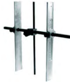
Part No. TOOL.05