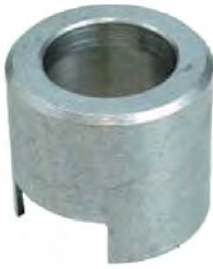
Part No. 4T40E.TOOL01

Removes the transaxle wiring harness connector from the case.