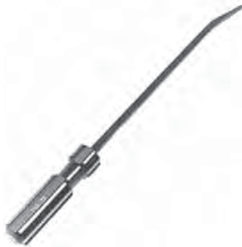
Part No. TOOL.26